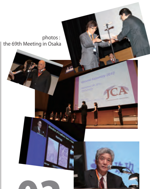
photos : the 69th Meeting in Osaka